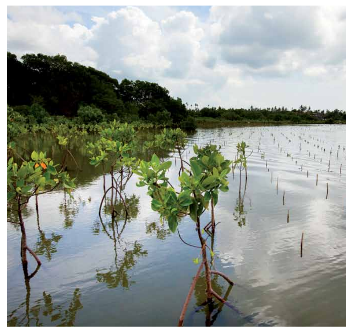
Rehabilited mangrove forests in Bali provide storm protection to local communities.

To fully realise nature's contributions to development and prosperity, the focus needs to be not only on effectively responding to the symptoms (e.g. degradation, loss of ecosystem functions and services) but also to the underlying causes and drivers of the problems (e.g. production methods and consumption levels). Addressing these simultaneously will be essential to achieving lasting results.