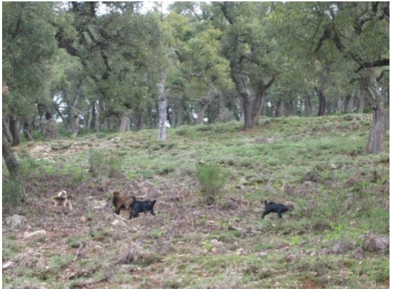
Figure 1: Provision of grazing habitats in forest areas is important for local livelihoods

In addition, the impact of forest cover on sedimentation was estimated as the difference in sedimentation rates in two situations - if the forest cover exists and without forest cover. The sedimentation rates were estimated using different models of soil losses such as Morgan, Morgan and Finney (MMF)<sup>2</sup>, and Pacific Southwest Inter-Agency Committee (PSIAC)<sup>3</sup>. Carbon sequestration was estimated using the IPCC model and biomass data from the forest inventories.