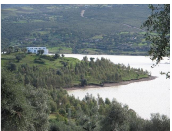
Figure 2: Forests play an important role in reducing sedimentation

Secondly, the economic valuation of the multiple goods and services was based on different methods: