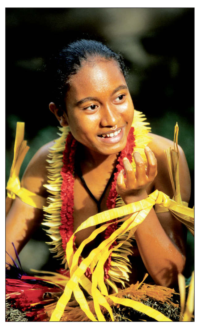
TEEB recognizes that values are a product of different world views and perceptions on the relationship of humans and nature, and treats them as legitimate and valid in their respective socio-cultural contexts.

'Demonstrating value' in economic terms is critical for understanding the consequences of changes resulting from alternative land-use or landmanagement options, and can be an important aid in achieving more efficient use of natural resources. For example, an assessment in Kampala, Uganda compared the costs and benefits of conserving the ecosystem services provided by wetlands in treating human wastes and controlling floods against the costs and benefits of providing the same services by building water treatment facilities or concrete flood defences, and found the former to be considerably less expensive (Emerton et al., 1998). Demonstrating value can also highlight the costs of achieving environmental targets and help identify more efficient means of delivering ecosystem services. Valuation in these circumstances enables policy-makers to address trade-offs in a rational manner, correcting the bias typical of much decision-making today, which tends to favour private wealth and physical capital above public wealth and natural capital.