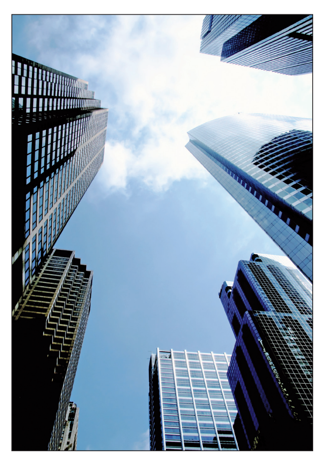
Companies that understand and manage risk presented by biodiversity loss and ecosystem decline, establish operational models that are flexible and resilient to these pressures, and move quickly to seize business opportunities, are considered more likely to thrive in future scenarios.

TEEB is featured prominently within intergovernmental strategies and processes on biodiversity and ecosystem service issues<sup>(11)</sup>.